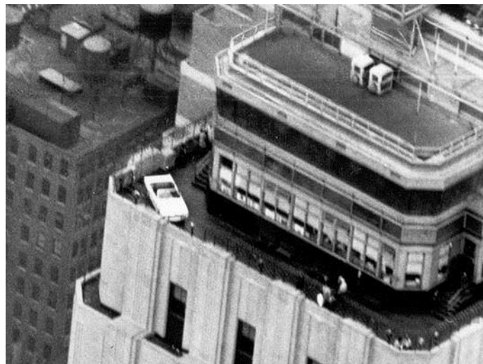
Ford Mustang on the Empire State Building 1964

Visitors saw the new Mustang convertible on the observation deck for 54 hours from 8 a.m. to 2 a.m. on April 16 and 17, which just happens to coincide with the New York Auto Show.