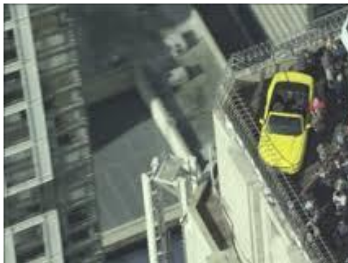
Ford Mustang on the Empire State Building 2014

Visitors saw the new Mustang convertible on the observation deck for 54 hours from 8 a.m. to 2 a.m. on April 16 and 17, which just happens to coincide with the New York Auto Show.