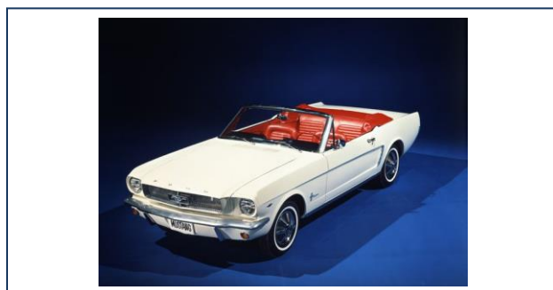
1964 1/2 Ford Mustang Convertible